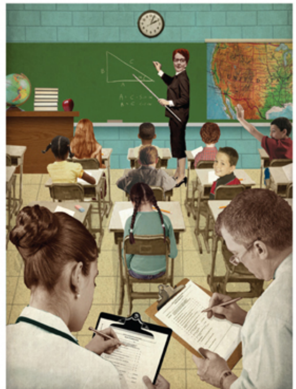
ILLUSTRATION / MICHAEL WARAKSA